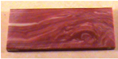
Red dyed wood