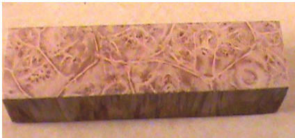
Birds eye maple