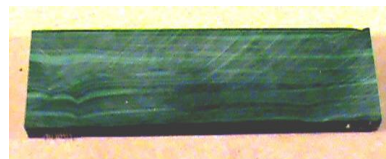
Green dyed wood